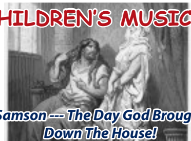
Samson --- The Day God Brought Down The House!

This is the story of Samson, the strongest man in the Bible, who had the worst "Bad Hair Day" in history. God promises a childless couple they will give birth to a Hebrew Hero, who will clobber their enemies, the Philistines. So Samson is tricked by Delilah, an enemy spy, and locked up. A prisoner in a Philistine jail, Samson finally prays for the strength to "Bring Down the House" on his captors.