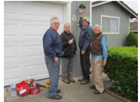
"How many Methodists does it take to change a light bulb??"