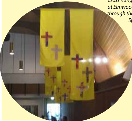
Cross hangings made by women at Elmwood Correctional Facility through the Campbell UMC Art & Spirit Ministry